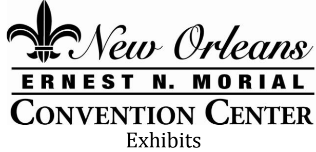
Exhibit No. 2: Scope of Work

The Scope of this Project consists of the furnishing and installation of sheet metal ductwork, exhaust fans and grilles in the attic above the Conference Auditorium as Ceiling Space Humidity Remediation.