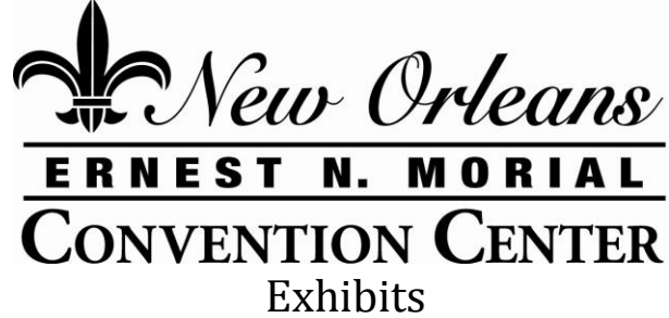
Exhibit No. 1: Contract Relationship:

The Contract shall be between The Ernest N. Morial New Orleans Exhibition Hall Authority (“the Authority”) a political subdivision of the State of Louisiana. New Orleans Public Facility Management, Inc. (“NOPFMI”) a quasi-public body that is charged with the responsibility of managing the Ernest N. Morial Convention Center-New Orleans (“ENMCCNO”) on a day-to-day basis. NOPFMI and the Authority are referred to herein collectively as “Owner” and the Successful Contractor. The Owner and Contractor may be referred to collectively as the “Parties”.